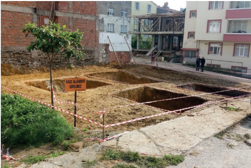
Fig. 2. The excavation area in the Gelincik district of Sinop: general view of trenches A-D