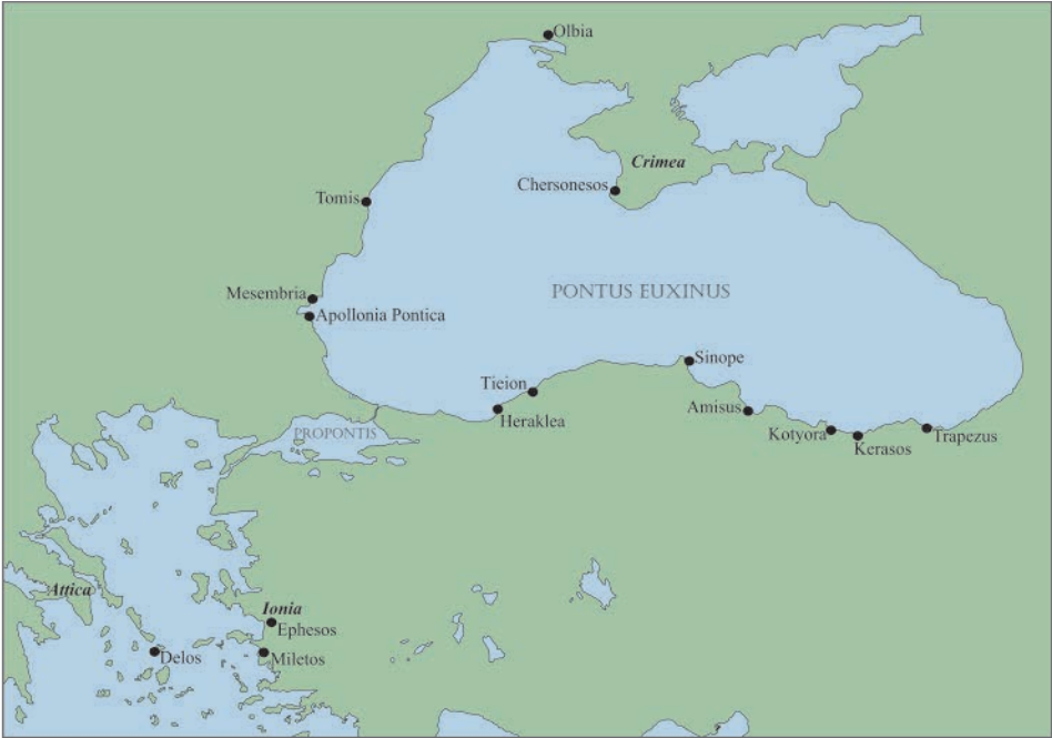
Fig. 1. The location of the archaeological site of Sinope in northern Turkey (Map S. Pataci, 2018)