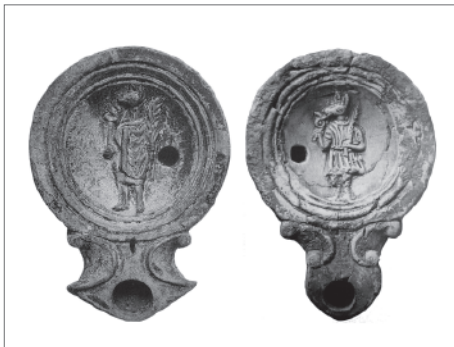
Fig. 3. Anubis: left, wearing a chlamys; right, in a tunica, from Lurs (After Podvin 2011: Adg1.m(1), Pl. 28 [left]; Adg2.m(7), Pl. 29 [right])

The motif of Anubis alone is typically born outside Egypt. It has been demonstrated (Podvin 2011: 66–68) to be closely linked to the representation of the triad Harpocrates, Isis and Anubis, en vogue in Italy (Rome and Campania) during the 1st century AD. Representations of Anubis alone, first attested in Italy, enjoyed considerable success, spreading to southern Gaul, the Iberian Peninsula, North Africa, and even Brittany, which may look a priori as a surprise considering that this god was not particularly known to non-Egyptian populations.