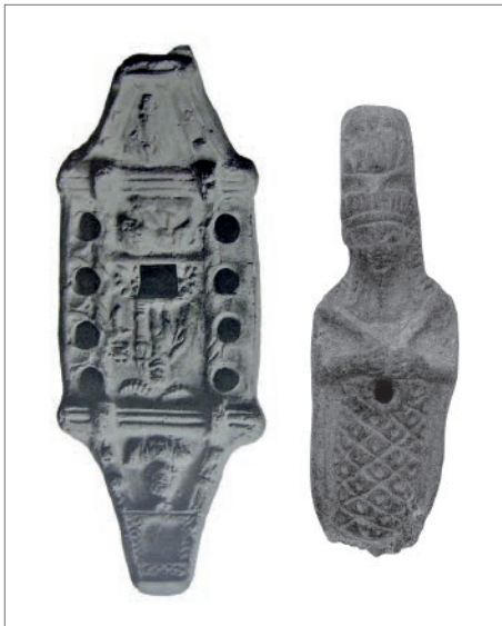
Fig. 9. Plastic lamps: left, boat-shaped lamp, Alexandria(?); right, mummiform lamp, Alexandria (After Weber 1914: 31, No. 12 and Pl. I [left]; Gallo 1998: 154, Fig. 2 [right])