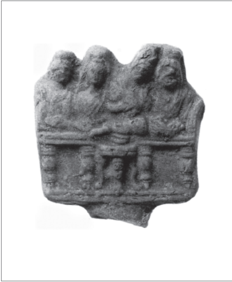
Fig. 8. Hermanubis, Demeter, Isis, Harpokrates and Sarapis on a klinè , ornamental handle, Rome (After Podvin 2011: Hbd-DEbd-lbg-SRbg.m(1), Pl. 62)