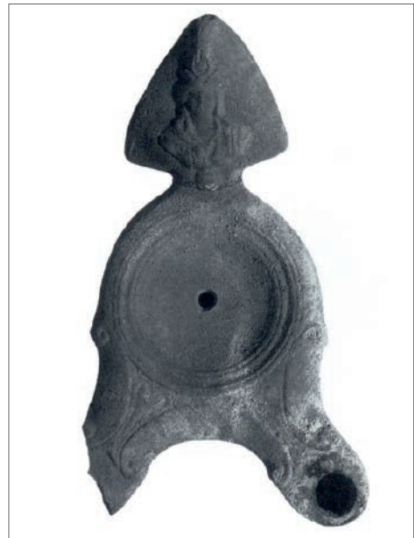
Fig. 2. Isis in bust form on a delta -shaped handle attachment of a two-nozzled lamp, Alexandria (After Georges 2003b: 505)