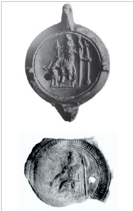
Fig. 1. Sarapis enthroned: top, facing, Rome; bottom, turned leftwards, Marina el-Alamein (After Podvin 2011: Stf.m(5), Pl. 7 [top]; Daszewski 1991: 103, Fig. 5 [bottom])

Sarapis appears very often on the ornamental handles in the collection of the Alexandria Museum, where these ornaments ( delta -shaped or plastic) constitute 62% of the occurrences, against roughly 16% outside Egypt. The collections would have favored handle attachments over decorated discs, hence these numbers may not be reliable, but in general handle attachments constitute a feature particularly appreciated among the potters of Alexandria and its hinterland (Chrzanovski 2015: 33), especially for lamps with a minimum of two nozzles.