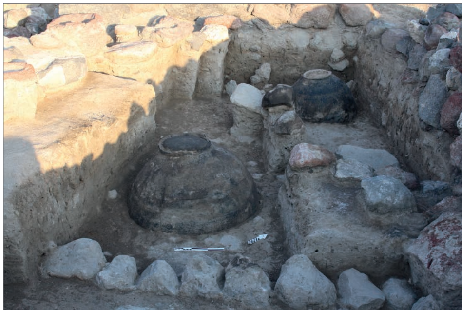
Fig. 2. Two pithoi in unit S1

In line with the above, it is also likely that the dividing wall unearthed in the “square” separated the potential dwelling quarters from the outskirts of the settlement (remains of outer walls are hoped to be excavated further west and north) in a move both symbolic and practical: the households inside the stone wall are somehow protected and the area west of the wall is easily accessible to inhabit-