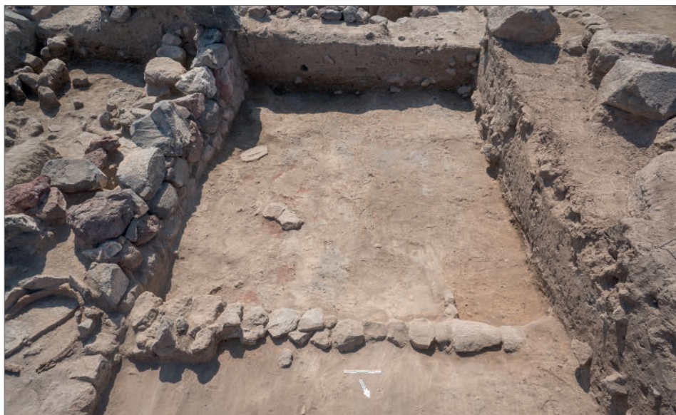
Fig. 3. The floor level inside structure S10 (University of Warsaw Metsamor Project | photo E. Kwiatusińska)