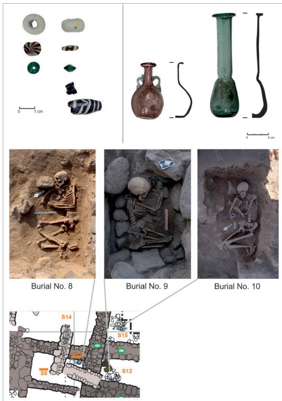
Fig. 6. Burials from the late Roman period: top left, glass and stone beads from burials N8 and N9; top right, glass bottles from burial N9; center, top views of the burials, from left, N8, N9 and N10; bottom left, blow-up of area with graves