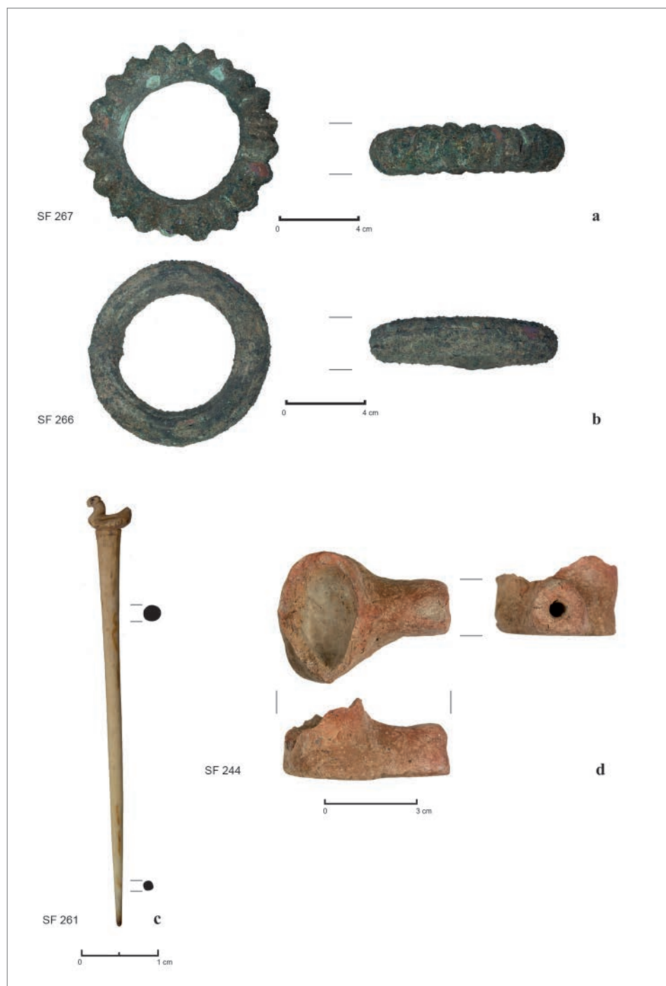
Fig. 7. Selected small finds: a, b – bronze bracelets found in a pithos; c – bone pin; d – clay melting spoon (University of Warsaw Metsamor Project |)