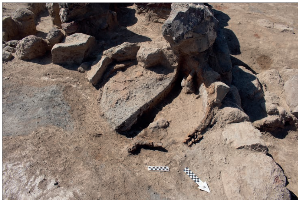
Fig. 4. Circular clay kiln found near structure S10