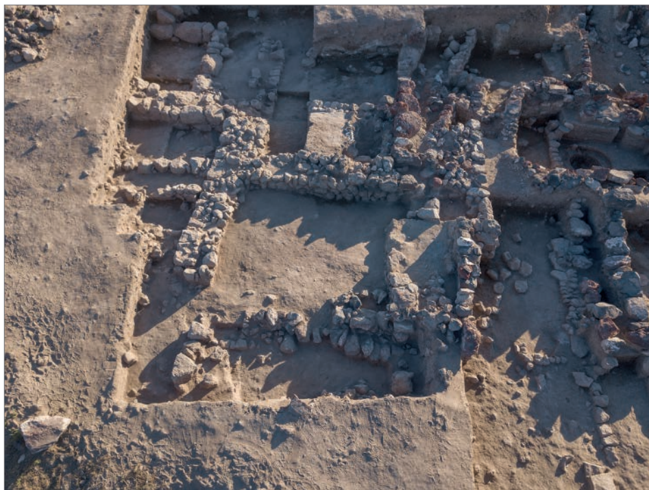
Fig. 5. Aerial photo of the “large building” (University of Warsaw Metsamor Project | photo O. Bagi)

The remains of this earlier structure, S 9 , are represented by fragments of a single wall (1062). A pivot stone at the southern edge could indicate the position of an entrance. Objects found in 2017: a small clay oven filled with ashes and a large flat grinding stone together with a round clay bread stamp discovered by the east wall of the building, suggest its function (Jakubiak et al. 2018). “Bread seals”, as already attested by other finds of this kind from Armenia, are commonly associated with religious activity (Badalyan et al. 2014: