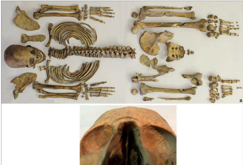
Fig. 9. Skeleton from Burial N9 (University of Warsaw Metsamor Project |)