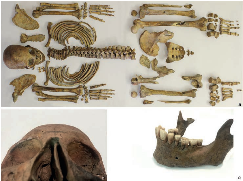
Fig. 8. Skeleton from Burial N8