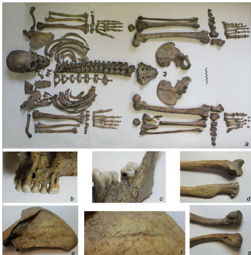
Fig. 10. Skeleton from Burial N10 (University of Warsaw Metsamor Project | photos T. Zakyan)

The individual was lying on the right side in flexed position, the head to the east, facing north, the legs flexed V-shaped [see Fig. 6 center right]. The bones were well preserved except for some of the long bones and the right ribs [Fig. 10:a]. The ossification of cranial sutures and long bone length, as well as tooth wear, indicate an adult (age 40–50), a male judging by the skull and pelvis morphology. An arrowhead, pre-